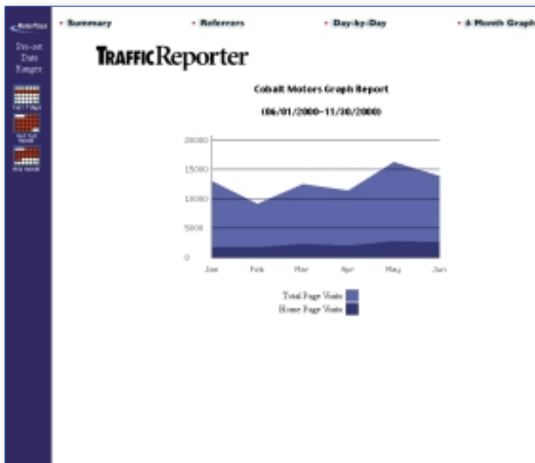
6 Month Graph Report

Designed specifically for dealers, TrafficReporter's easy-to-generate, easy-to-read reports track your website's traffic so you get a clear picture of how your Internet program is performing. Powerful graphics help you see what is working to attract customers so you can make the most of your online marketing dollar.